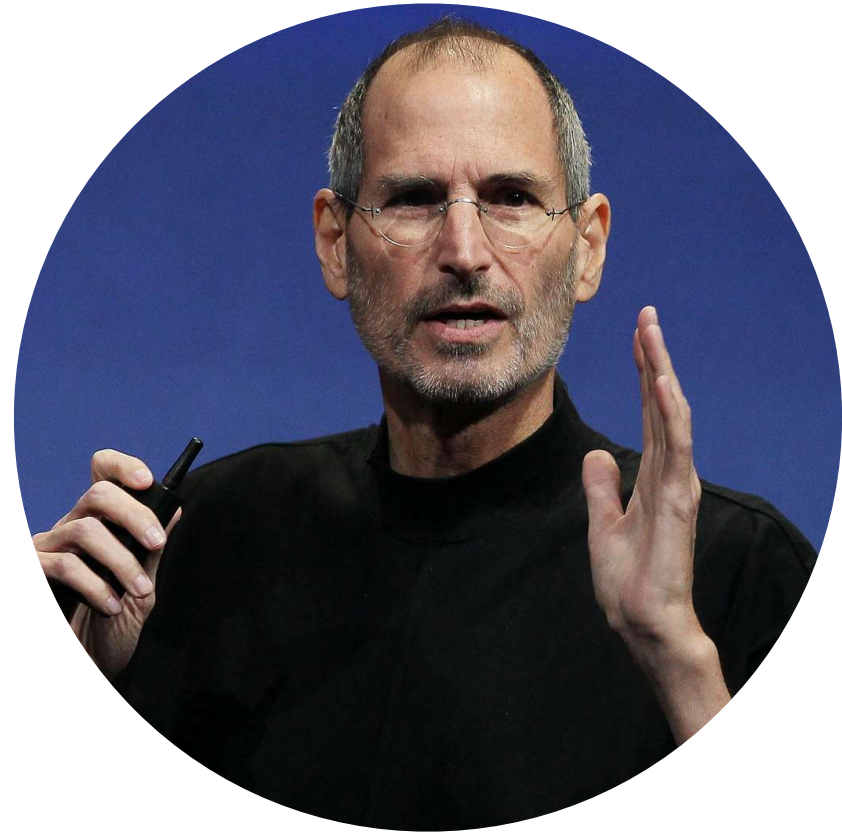
Steve Jobs - Founder of Apple

He is my idol because Steve is very creative, and he is a leader with impressive vision.